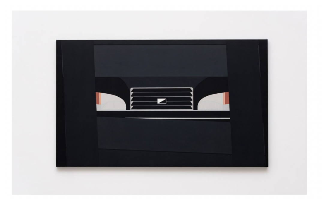
Wanda Pimentel, Sem título [Untitled], 1995, acrylic on canvas, 120 × 200 cm.

The late Pimentel was a student of Ivan Serpa and synthesised his hard-edge geometric abstraction into what became known as New Figuration. While an exhibition at MASP, São Paulo, in 2017 concentrated on her Envolvimento (Involvement, 1968–84) series, in which scenes of domestic life are rendered in a bright lurid palette, the six paintings gathered in Os Anos Noventa (and painted after her soap opera outing) have a much more subdued colour and atmosphere. Pimentel's rebuttal of the patriarchy and consumerism, however, remains constant. In Roupa (Clothing, 1996), typically painted in acrylic on canvas, with the artist's sharp lines and invisible brushwork, a gloomy fenced path leads up to a room piled messily with clothes. A play perhaps on the sexist adage that a woman's work is never done. In Untitled (Monuments series) (1994) a monument is seen in silhouette, the fact that it is a male figure still apparent despite the gloom; in Untitled (vitrine) (1996) a man's jacket is encased in a glass box, like a mausoleum. Even in death, the works seem to say, men dominate.