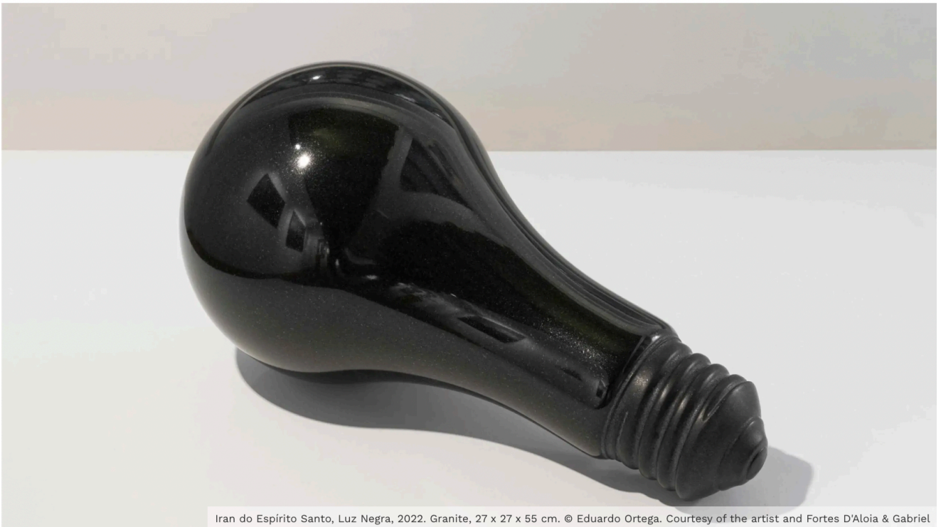
Iran do Espírito Santo, Luz Negra, 2022. Granite, 27 x 27 x 55 cm.