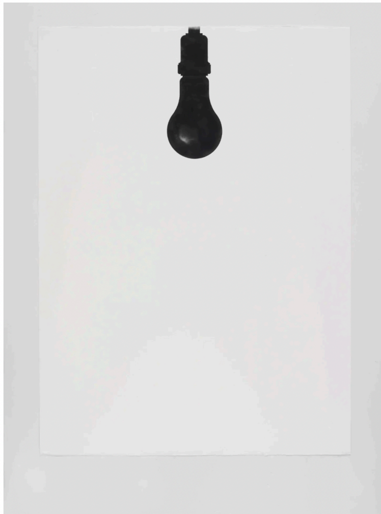
Iran do Espírito Santo, Luz negra IX , 2021. Watercolour on paper, 77.5 x 56 cm.

For three decades this has been a constant strategy for the artist, exploring ordinary objects that are usually neglected due to their banality. With the restriction of the materials, Espírito Santo converges the tangibility of matter and the conceptual nature of artificial objects, using geometrical definitions that are implicit in them. The material's density and weight conflict with the image quality of the sculptures, as exemplified in Luz Negra (2022), where the hyperreal finishing, not found in a functional light bulb, is elevated from the ordinary to the realm of auratic icon.