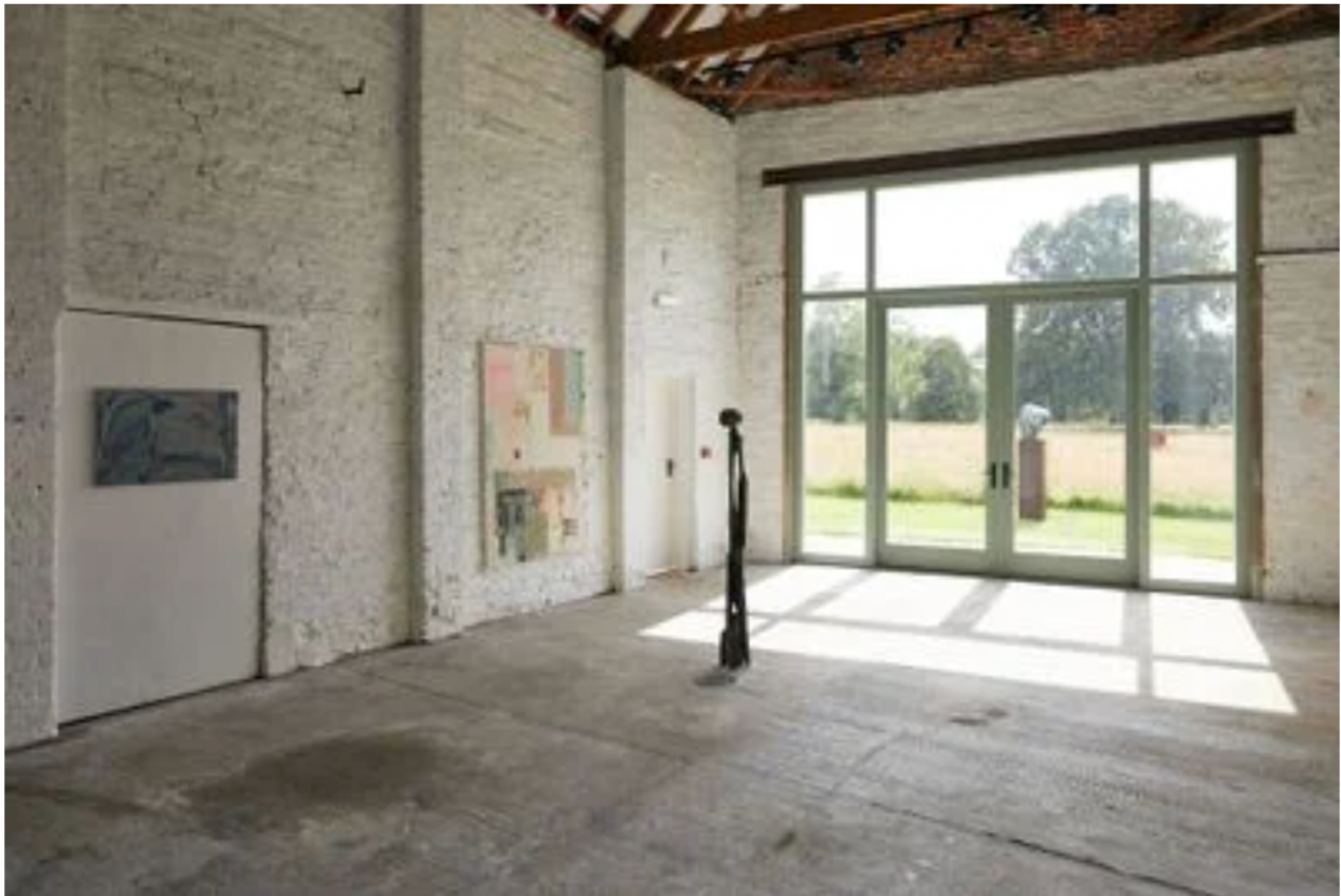
Exhibition view: Ghosts in Sunlight , Thirsk Hall, North Yorkshire (5 July–31 August 2024).

Now on view at Thirsk Hall, an 18th-century townhouse nestled between the dales and moors of North Yorkshire, is Ghosts in Sunlight , a group show of 16 artists curated by Ocula's Rory Mitchell .