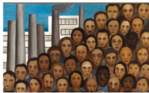
Club tropicália: the mesmerising power of Brazilian art

https://www.theguardian.com/artanddesign/2023/may/18/brazilian-artist-beatriz-milhazes-maresias-turner-contemporary-margate