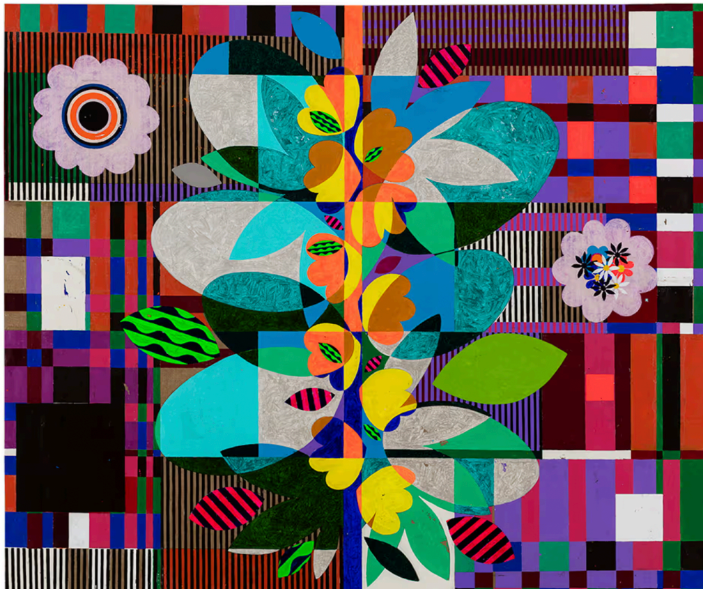
📷 Beatriz Milhazes' Douradinha em cinza e marrom, 2016

Ahead of a historic survey of her work at Margate's Turner Contemporary, the Brazilian artist discusses her global inspirations, shape-shifting patterns, and why she's still an optimist