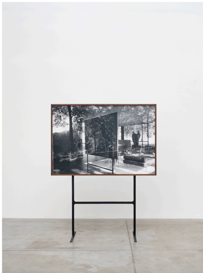
Mauro Restiffe, Glass House easel , 2022, Gelatin silver print, 100 x 150 cm [39.37 x 59.05 in, Ph: Eduardo Ortega. Courtesy of the artist and Fortes D'Aloia & Gabriel, São Paulo/Rio de Janeiro, Brazil.

Iran do Espírito Santo and Mauro Restiffe are both included in MoMA's 'Chosen Memories: Contemporary Art From Latin America' , opening on April 25th. At the fair, works by both artists will emphasize reflections and mirroring as obstacles to visibility, challenging preconceived notions of representation (showing with Fortes D'Aloia & Gabriel, São Paulo, Main).