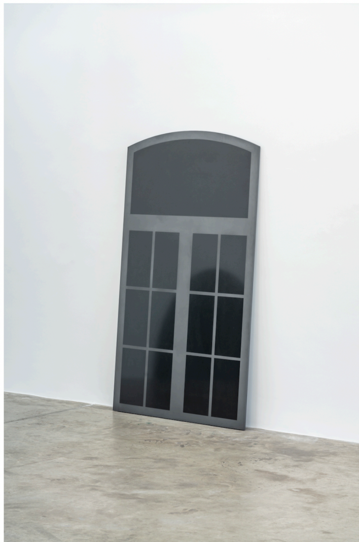
Iran do Espírito Santo, Janela reflexiva 5 / Reflexive Window 5 , 2020, Granito [Granite], 215 x 119,2 x 2 cm [84,64 x 46,92 x 0,78 in].

B'alab'äj (Jaguar Stone) , current showing at the SculptureCenter , continues artist Édgar Calel's engagement with the Mayan Kaqchikel cosmovision and the transmission of its concepts and practices to new publics through spaces of contemporary art. Calel's presentation at Frieze New York highlights the histories of marginalised peoples and cultures from different geographies of the Global South (showing with blank, Cape Town and Proyectos Ultravioleta, Guatamala City, Main).