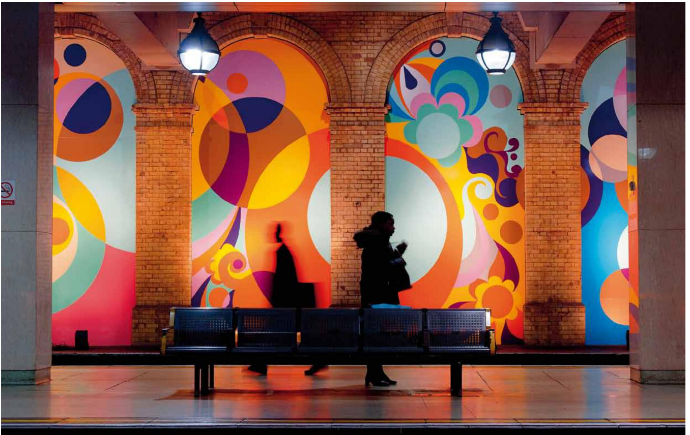
BEATRIZ MILHAZES, PEACE AND LOVE, 2005, Gloucester Road Station Project Platform for Art Underground, London / Friede und Liebe, Projekt für eine U-Bahn-Station.

this is notwithstanding the fact that the paintings always seemed to be essentially abstract from the beginning, despite their references to the ruffles and lace that spread like vines through the portraiture of the Baroque era. Somehow, the paintings' bright colors looked slightly dingy with time, like the walls in a tropical city a little past its prime. The historical resonances in Milhazes' work of the mid-nineties seemed to derive more from Mexico than from her own Brazilian heritage. By the beginning of the present decade her forms had become less detailed and more pared down—although “pared down,” by Mil-